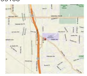
Woodbury 8450 Seasons Pkwy 55125